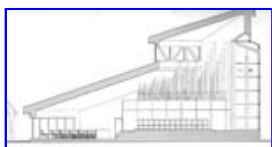
Section through sanctuary