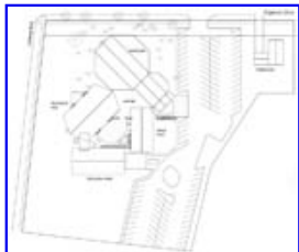
Proposed site plan