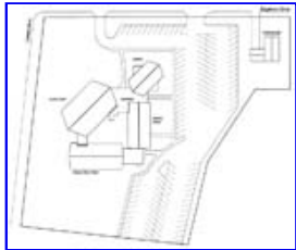
Existing site plan