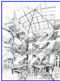
Sketch of interior atrium space

The exterior complimented the interior axis with a series of columns on the same angular projectile that supported a suspended world globe as a symbol of the knowledge obtainable to the library patrons.